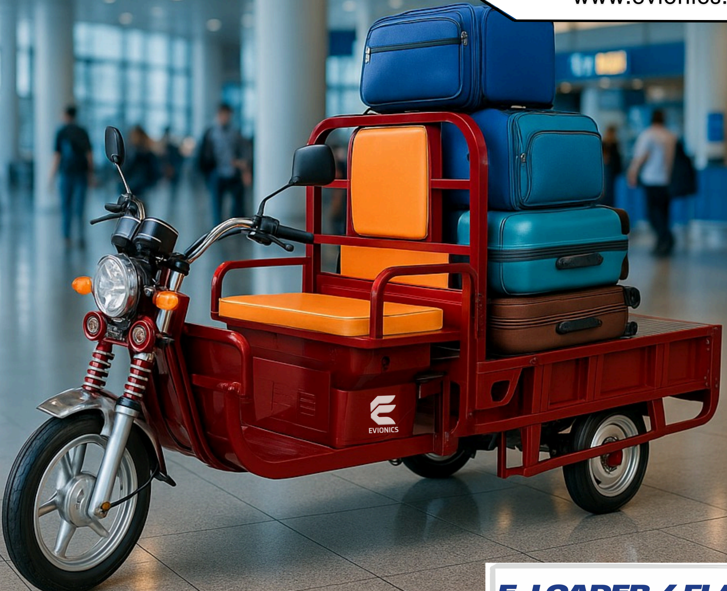
E-LOADER / FLAT BED